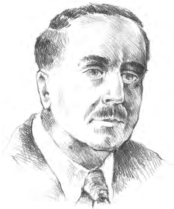
H G WELLS (1866–1946)